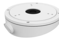
LTB309 Inclined ceiling mount