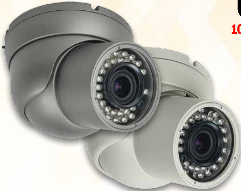
TIB 2032V-B Gray TIB 2032V-W Ivory