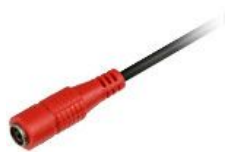
DC Power Input