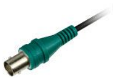
HD-TVI / 960H Analog Output