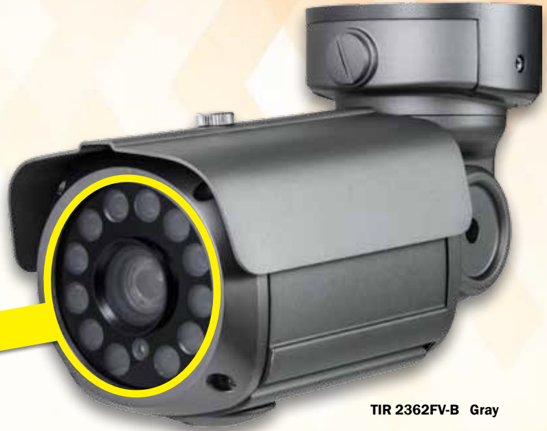
TIR 2362FV-B Gray