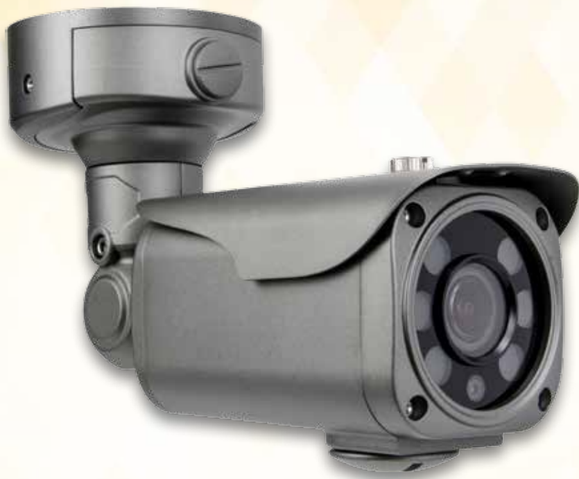
TIR 2664V-B Gray