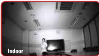
COMPETITOR'S DOME CAMERA