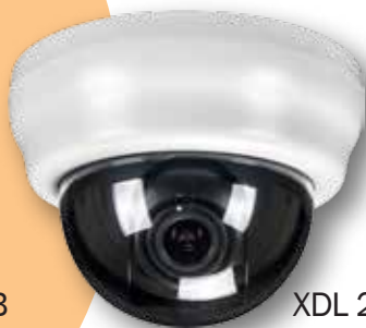
XDL 204V-W Available in White

HD-SDI FULL HD (1080p) Security Camera 2.8~12mm Mega-Pixel AVF Lens DC 12V or AC 24V