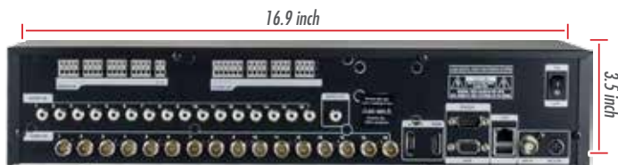
XVST MAGIC-16P XVST MAGIC-16M