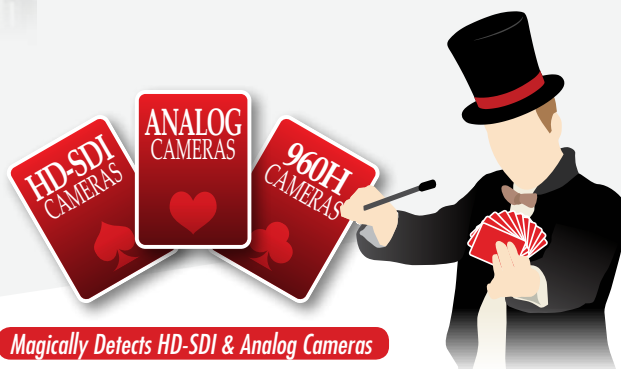
Magically Detects HD-SDI & Analog Cameras

Magic Technology is designed to adopt various video signal types in a single Digital Video Recorder. In other words, any past generation analog CCTV cameras you own, as well as HD-SDI - high definition digital CCTV- cameras will work seamlessly with the Magic DVR.